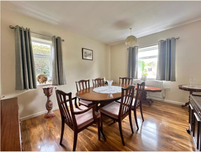
BEDROOM THREE / FORMAL DINING ROOM 13'1 x 10'6