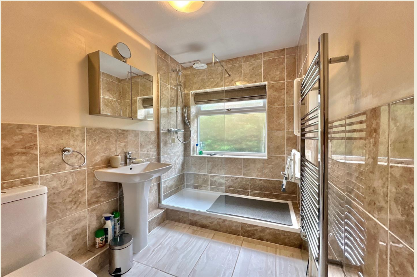
SHOWER ROOM 10'6 x 5'6