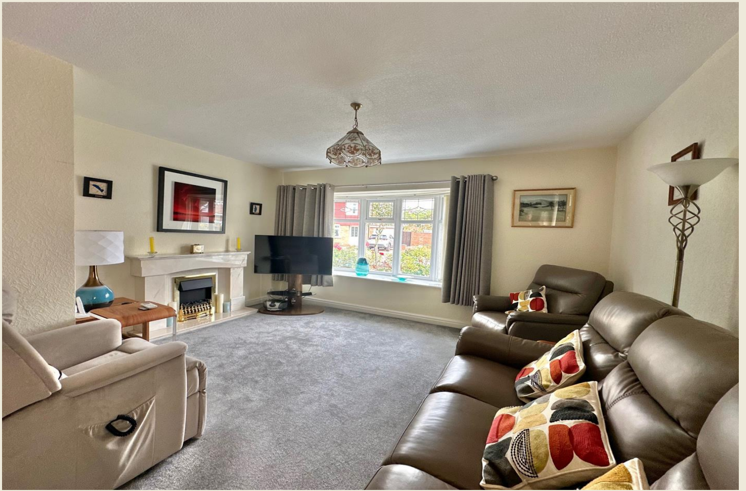
LIVING DINING ROOM 15'6 x 14'10