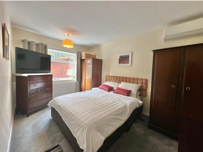
BEDROOM TWO 10'1 x 6'8