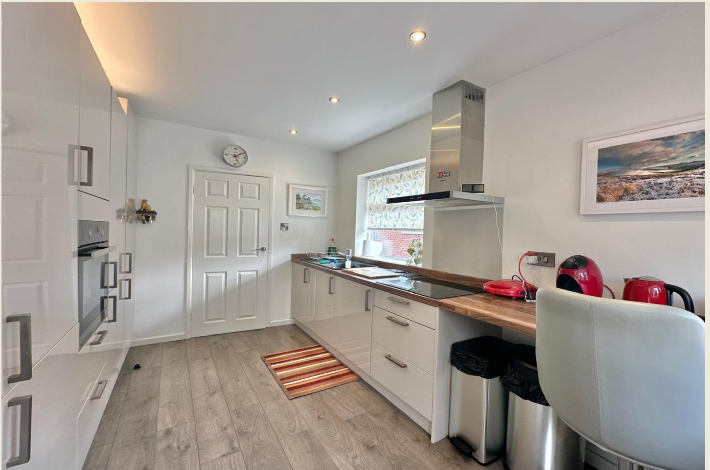
MODERN KITCHEN BREAKFAST ROOM 12'1 x 9'1